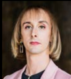
Nora Vision PW3 (Winnipeg, MB) (Treaty 1 Territory) Playwright