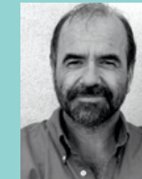
Michel Crête Scénographie, 1984