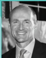
Colm Feore Acting, 1980