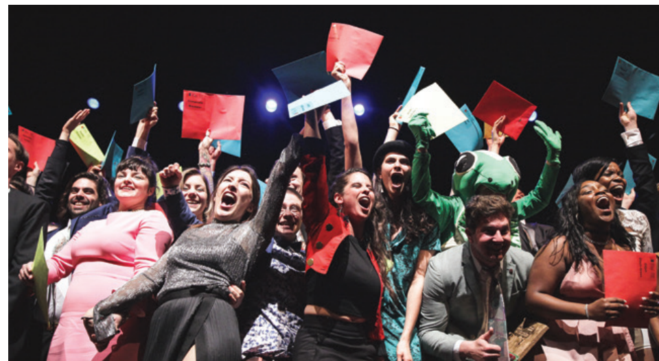
Graduation Ceremony, 2017

Find out more at theatretraining.ca or send us an email at info@ent-nts.ca