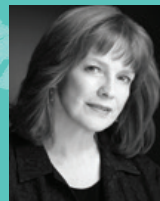
Blair Brown Acting, 1966