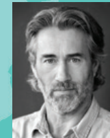
Roy Dupuis Interprétation, 1986