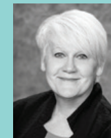
Penny Ritco Production, 1971